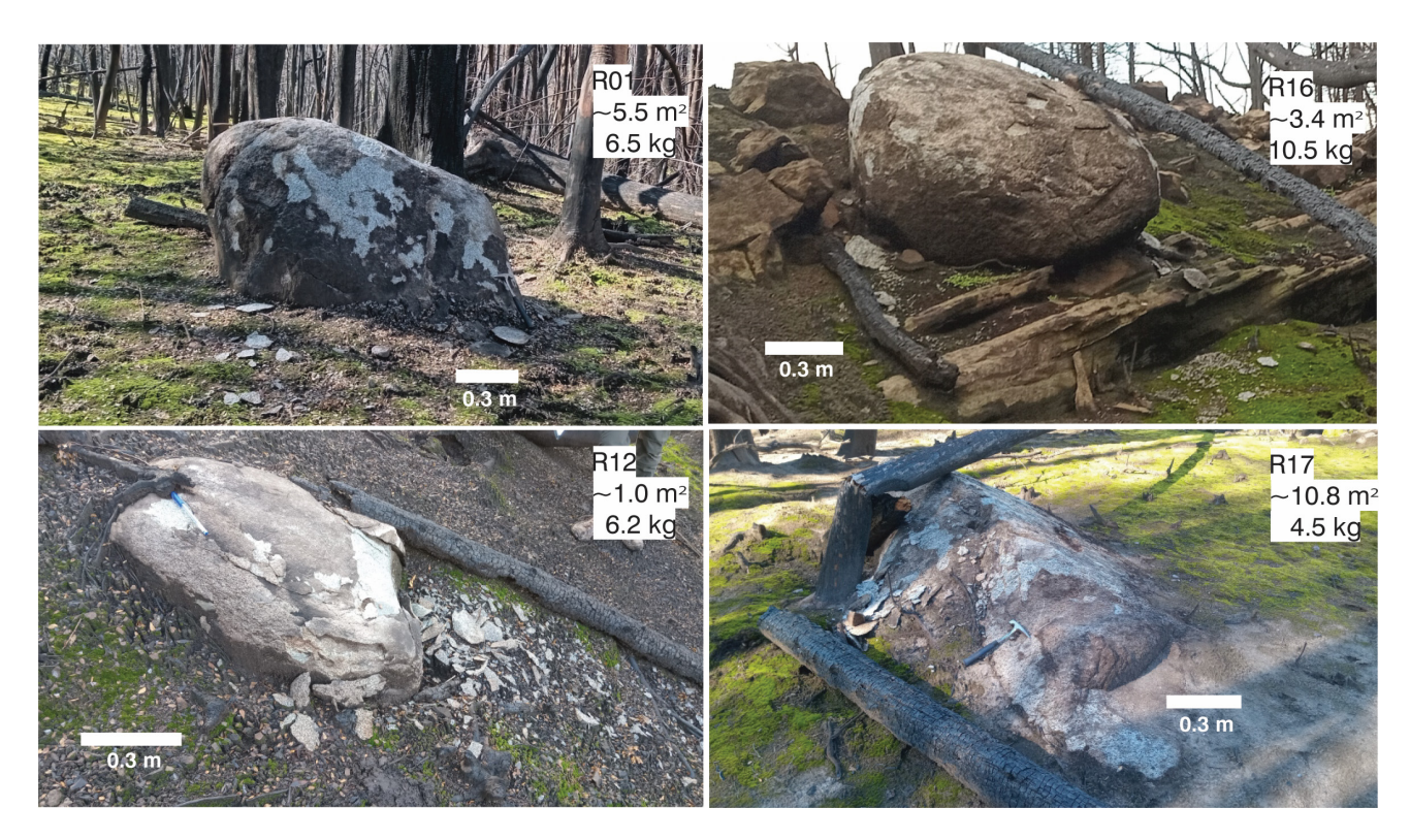
Figure 1. Granitoid erratic blocks surveyed after the LMRAFR fire (refer to fig. 2 for location details), with information provided for each block, including the estimated surface area and the total weight of sediment spalled by fire.

Our initial observations on outcrops in the aftermath (Fig. 1) underscores the significance of fire-induced rock spalling as a pivotal sediment production mechanism within the affected area. Consequently, the aim of this short contribution is to provide an inaugural acknowledgment of the fire-induced rock spalling process in the Patagonian region and to estimate the amount of new sediment yield in relation to the severity of this fire event.